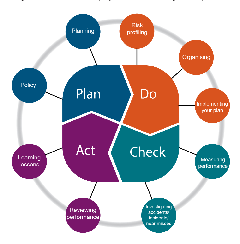
Figure 1 The Plan, Do, Check Act cycle (HSG 65 2013)