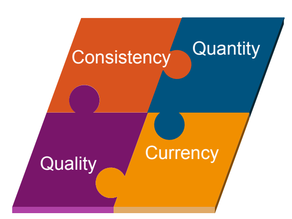
Figure 5 Evidence factors

judgement when deciding which criteria and evidence to use. The following issues should be considered: