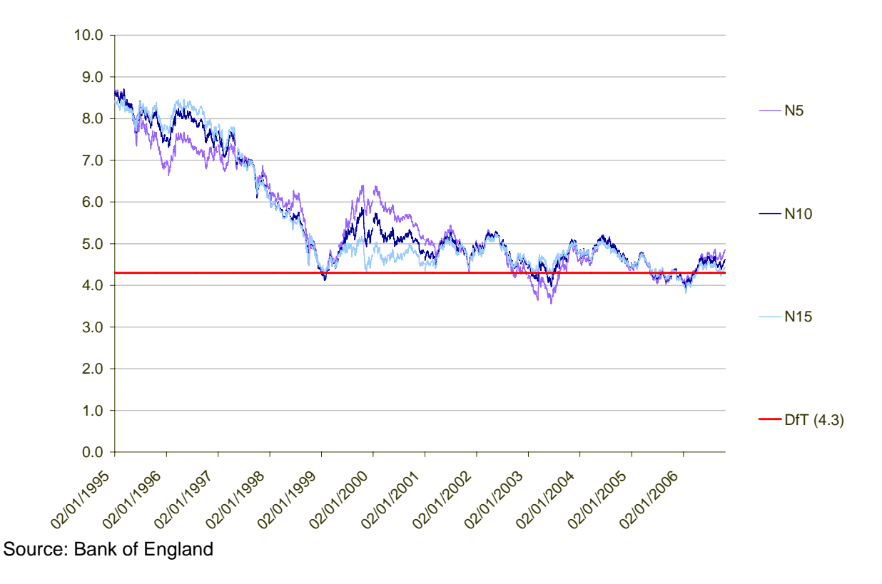
Figure 20 - Recent gilt returns (nominal)