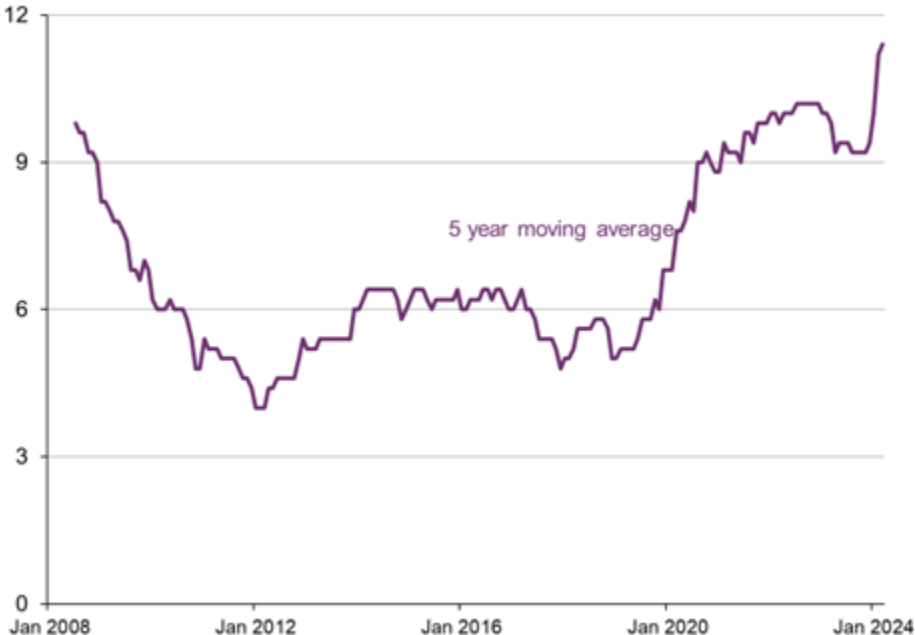
Figure 3a: High consequence earthworks failures

Graphs showing annual potentially high consequence earthworks failures and annual derailment rate. Potentially high consequence failures are those scoring 50 and above based on the CIV/185 standard.