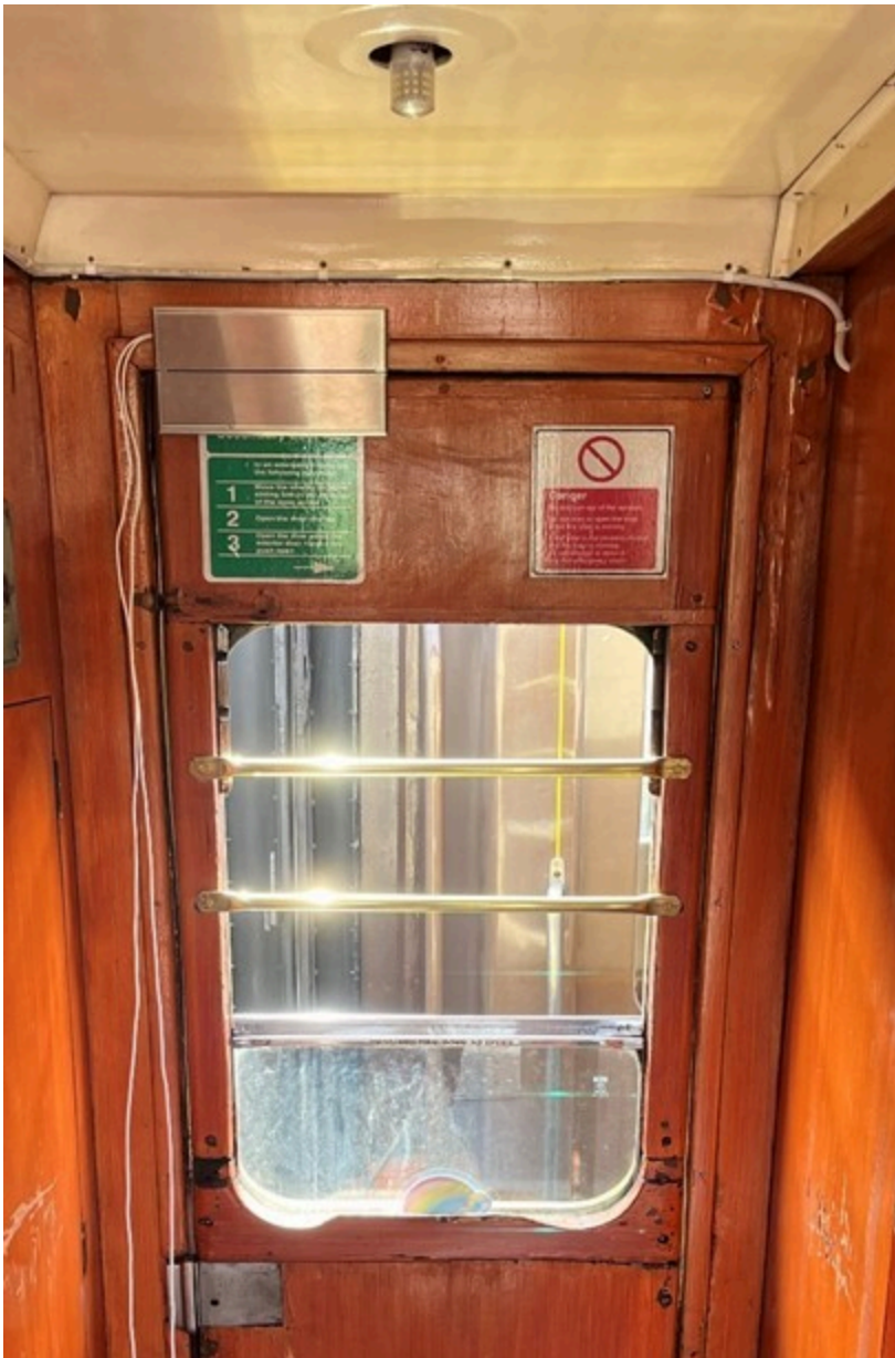
Photo: Vintage trains fitment of a central locked door bolt

We have assessed the change management arrangements of operators introducing new trains. Our expectation is that operators will ensure health and safety by design and take the opportunity to improve risk control with technology, such as the extending steps on Stadler trains, which in most situations eliminates the gap at doorways between train and platform. Instead, we have seen operators remove reasonably practicable engineering controls, choosing instead risk controls reliant on people, for example the switching-off of speed supervision systems on existing fleets or introduction of replacement fleets without compatible equipment. This will be the subject of further investigation.