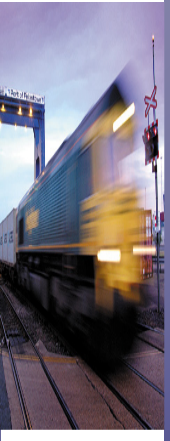
Delivering Choice for Business