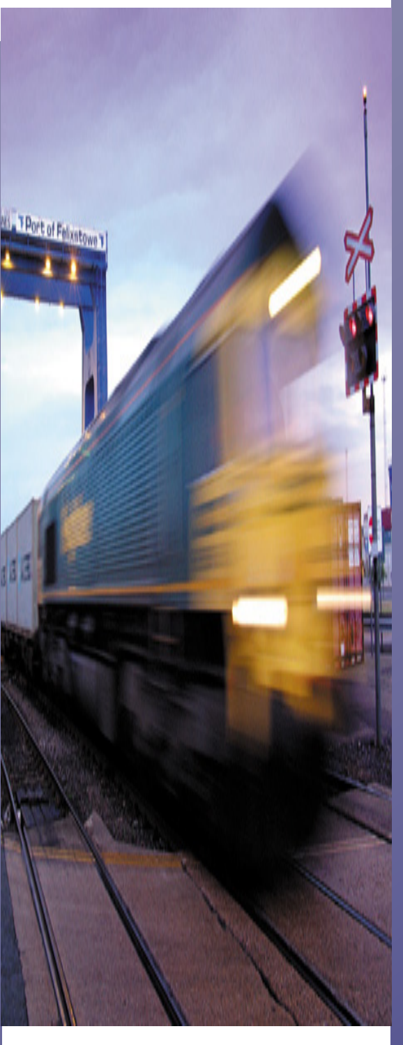
Delivering Choice for Business