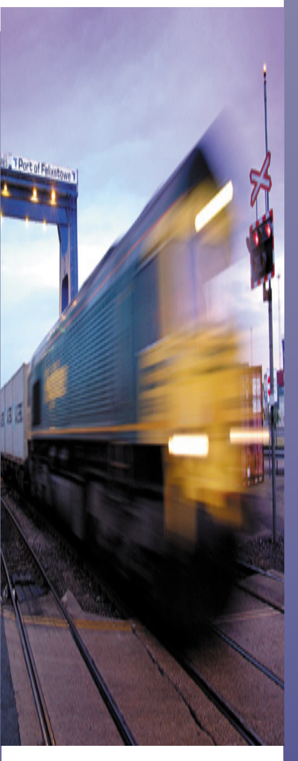
Delivering Choice for Business