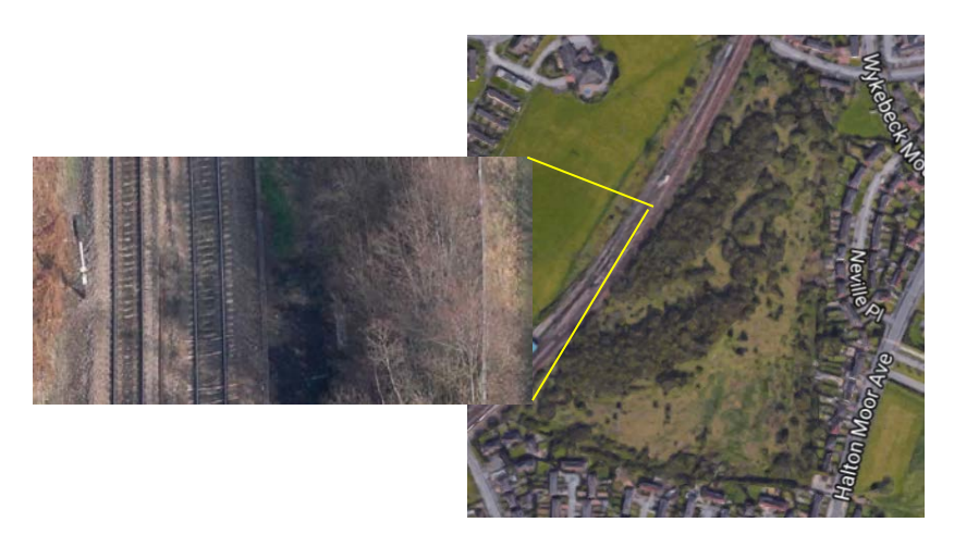
Figure 1 Arial photograph showing existing twin track alignment centred on former 4 track alignment adjacent to former Waterloo Carriage Sidings.

Possible requirement to reinstate 4 track alignment, removed circa 1966.