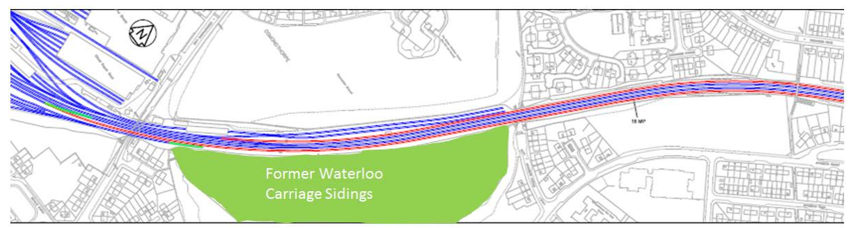
Figure 2. Indicative alignment shown adjacent to site.