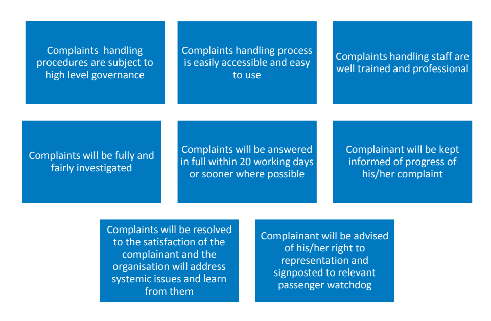
Figure 68: Ceomplaints handling service standards

3.653.66 All licence holders should establish and publish service standards in relation to complaints handling. Service standards should be written with the customer in mind and should be free of industry jargon. These provide a statement of what the complainant can expect from the complaints process and provide licence holders with a metric by which success can be measured. The following illustration indicates the sort of components we would expect to see in a published service level commitment.