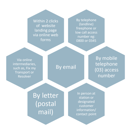
Figure 32: Complaint access routes