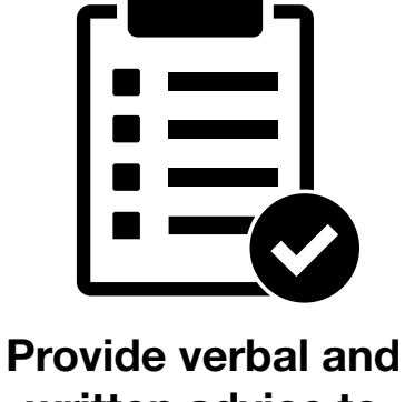
written advice to improve practices

Our aim is firm and fair enforcement of health and safety law